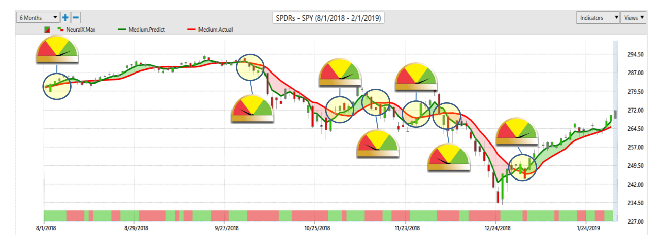
Figure 2 August 1, 2018 - January 31, 2019 SPY ETF

In November and early December the market was range bound and trading was choppy. When the market sold off in mid-December the Tactical Response trend trended out with the green trend line moving below the red trend line; therefore, we placed a trailing stop on the ETF. Shortly afterwards the trailing stop went off, the position was sold and remained in cash while the market continued to sell off. The market bottomed out on Christmas eve and then started to reverse some of its losses, when in early January the TR trended back in and we began to make buy purchases. January was a strong month for the market.