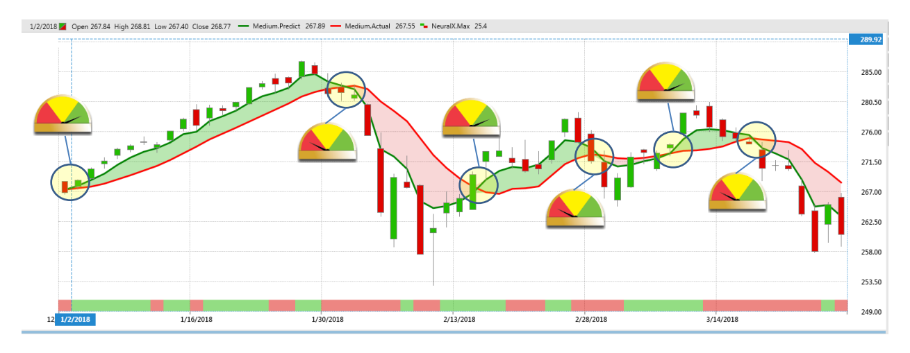
Figure 1 S&P 500 1/1/2018 - 3/30/2018

For illustrative purposes the beginning few months of 2018 is shown below utilizing the S&P 500 (SPY ETF) with the trends and the trade signals shown. The S&P 500 is trended in when the green trend line is above the red trend line. During the periods when the S&P 500 is trended in, the strategy would invest in the SPY ETF until the it trends out. When that position trends out we would sell the position, remain in cash, and wait for it position to trend back in.